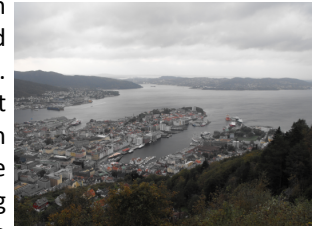
Bergen from Mount Fløyen

modernism are there in the form of large oil rig supply vessels and some modern looking buildings. There is a funicular railway that goes to the top of Mount Fløyen from where you are able to see all of Bergen and its surrounding suburbs. Our one "disappointment" was in the old town in a beautiful wooden building that had "heritage" all over it except for the discreet "golden arches" in the windows. Yes, it was a McDonald's!!